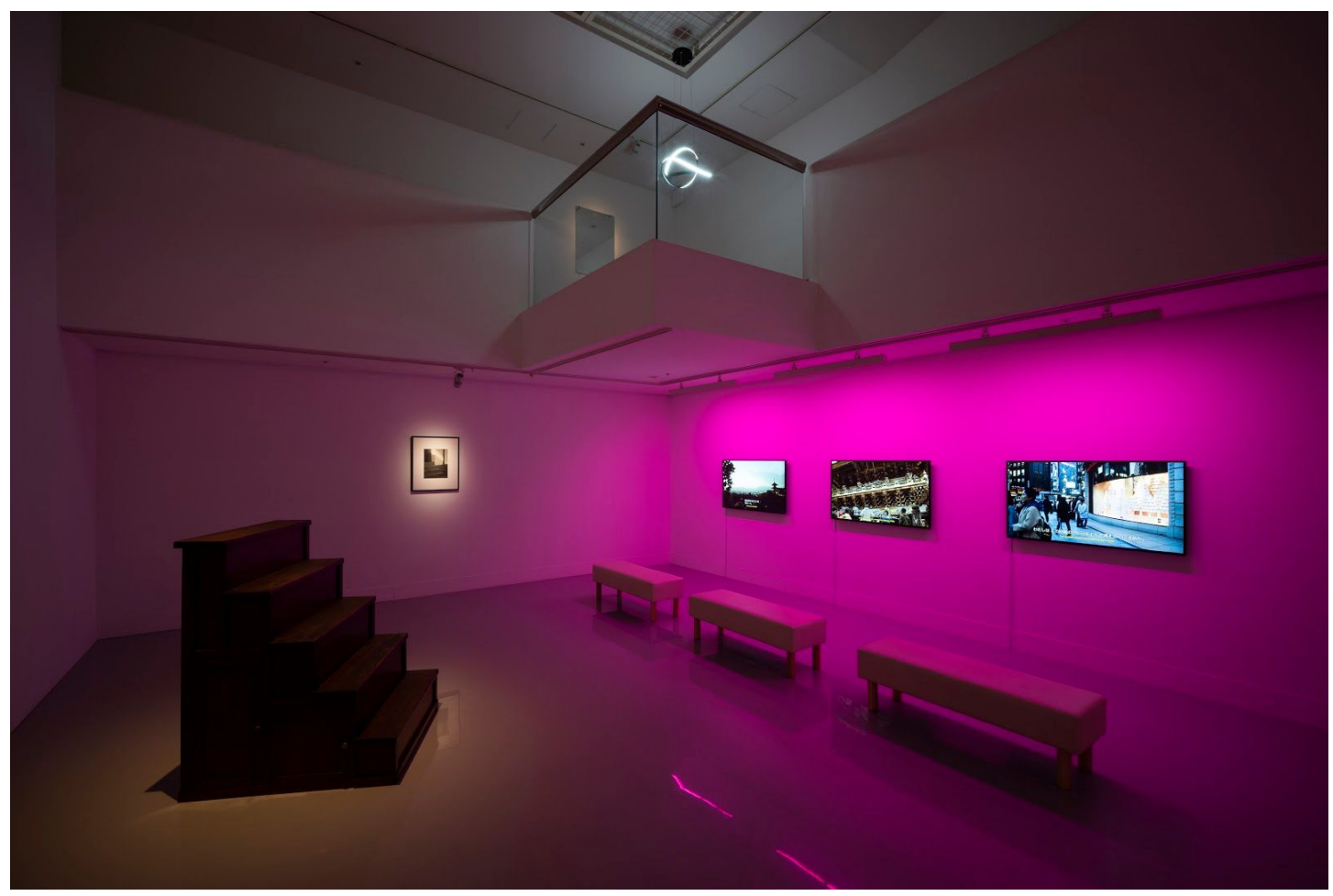
Installation view at Shiseido Gallery, Tokyo

2019 / HD video / Color / Silent / Japan / Japanese & English subtitles