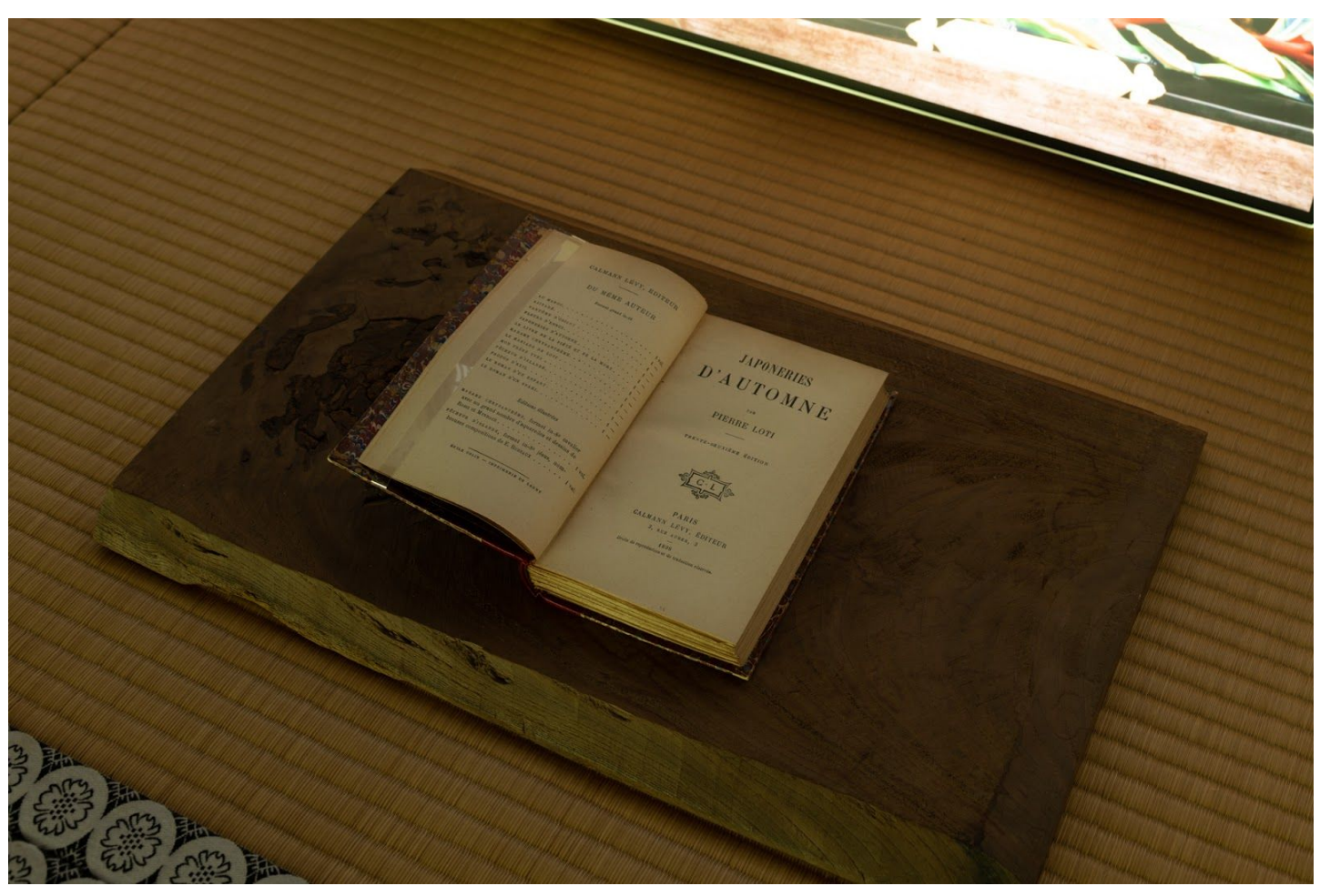
Installation view at Joju-in, Kiyomizu Temple, Kyoto

2019 / HD video / Color / Silent / Japan / Japanese & English subtitles