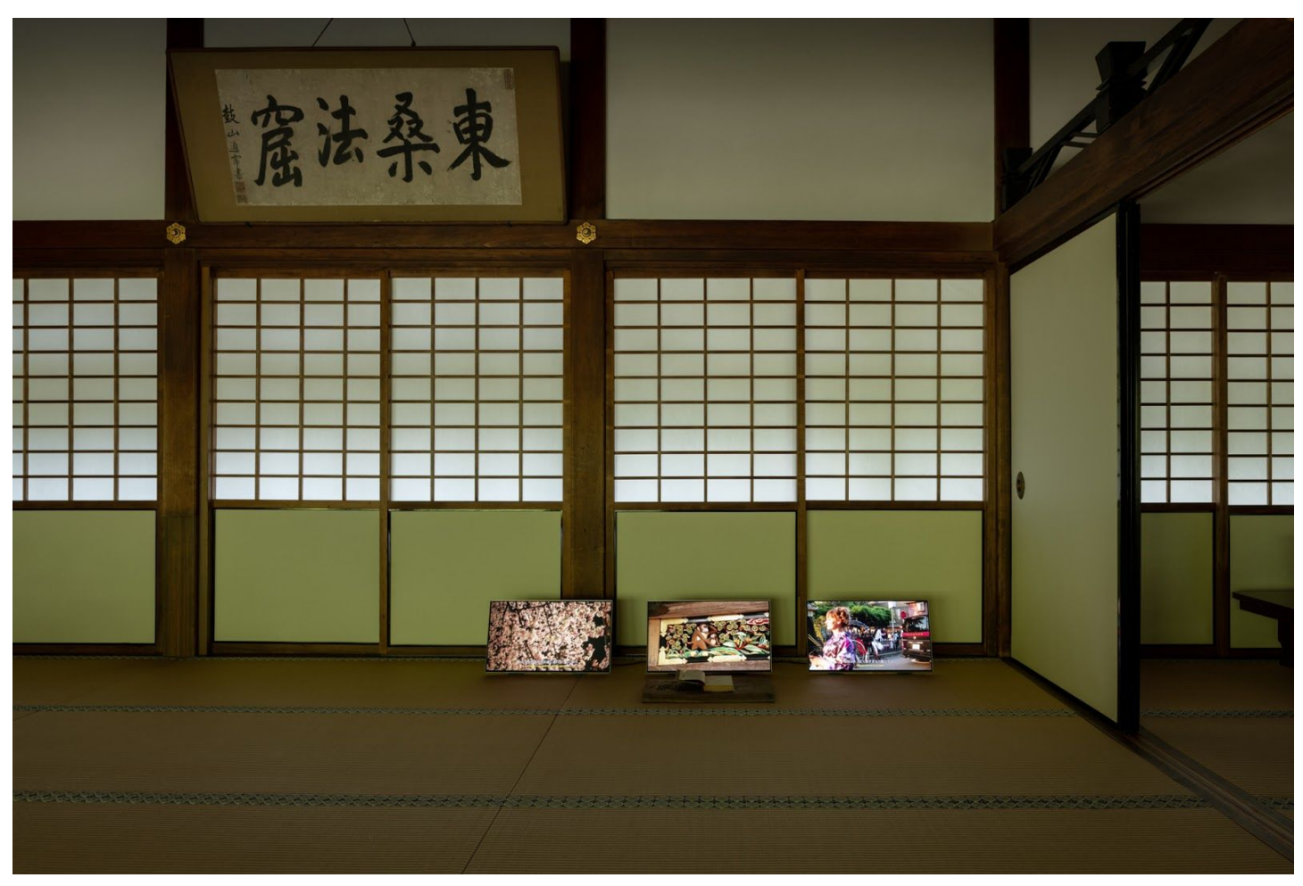
Installation view at Joju-in, Kiyomizu Temple, Kyoto

2019 / HD video / Color / Silent / Japan / Japanese & English subtitles