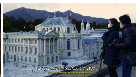
Video stills, Transcreation "La sainte montagne de Nikko (The holy mountain of Nikko)" 2019 HD video 18'10"