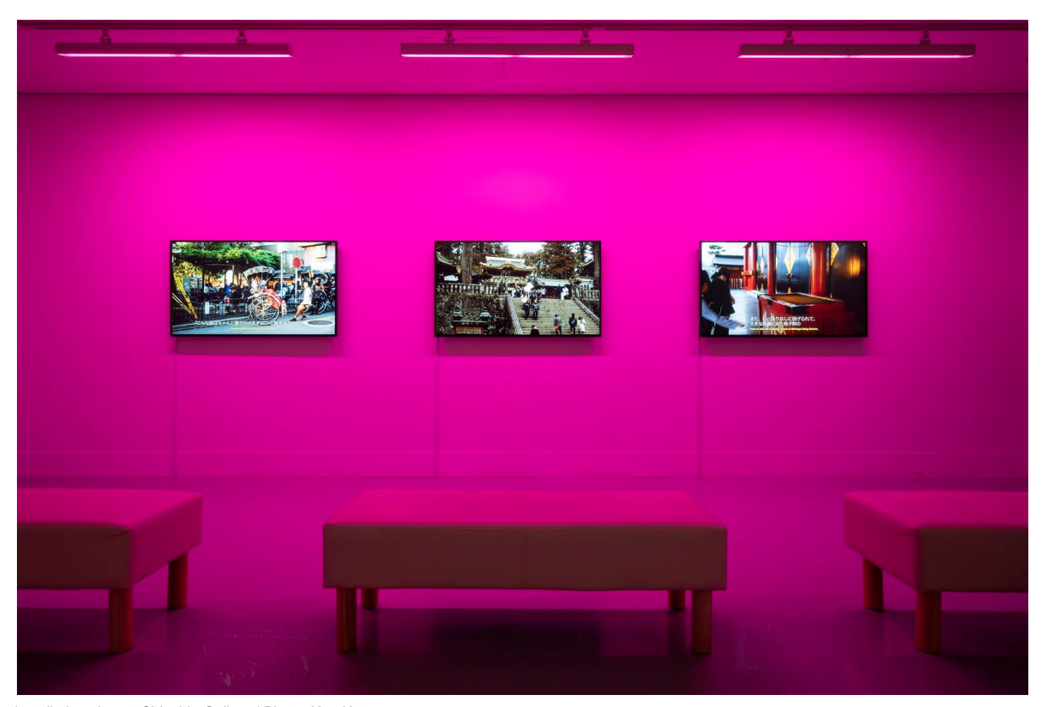
Installation view at Shiseido Gallery / Photo: Ken Kato

2019 / HD video / Color / Silent / Japan / Japanese & English subtitles