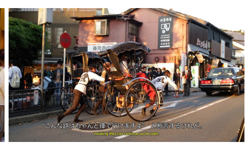
Video stills, Transcreation "Kioto, la ville sainte (Kyoto, the holy city)" 2019 HD video 05'12"